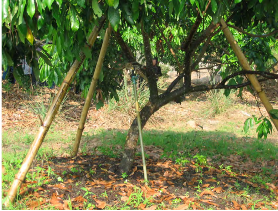
Figure 8. Irrigation use is based on crop water requirements, water availability, soil moisture levels and consideration of environmental impact on and off site.

Recommendations for irrigation use are typically available in industry publications produced by competent authorities such as the Department of Agriculture. Further advice can be obtained from advisers such as extension officers, consultants and agronomists. Before using an adviser, request them to show proof of their competence. Examples of proof are qualifications from an education institution, statement of knowledge and experience from a competent authority, and a training course certificate.