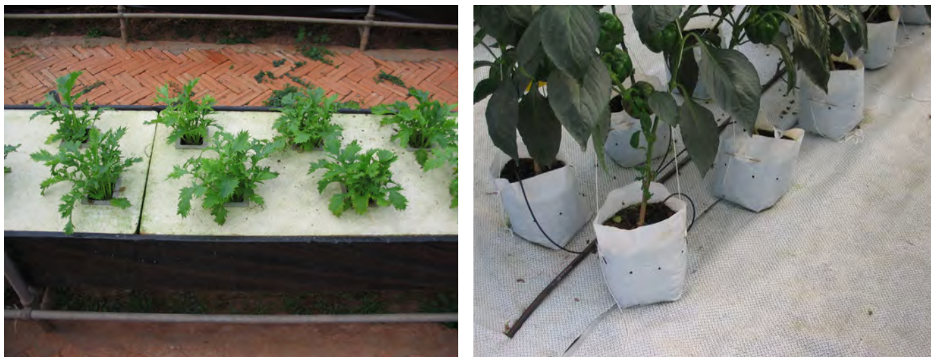
Figure 7. For hydroponic systems, the mixing, application and disposal of the nutrient solution is monitored and recorded.

In hydroponic production systems, large volumes of water containing high levels of nutrients are used. All solutions must be monitored for nutrient levels and disposed in a way that does not cause degradation of land, waterways and underground water. The types of nutrients, application rates, monitoring results and the method of disposal must be recorded.