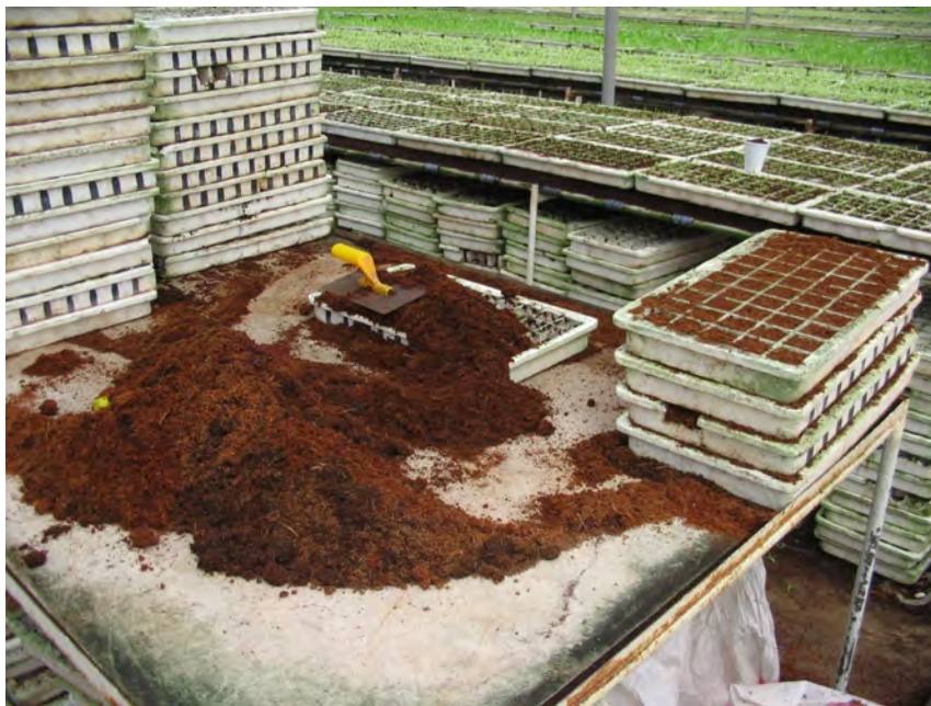
Figure 5. The use of chemical fumigants to sterilise soils and substrates is justified.

Examples of records for obtaining and applying chemicals are contained in Section 5. Examples of documents and records.