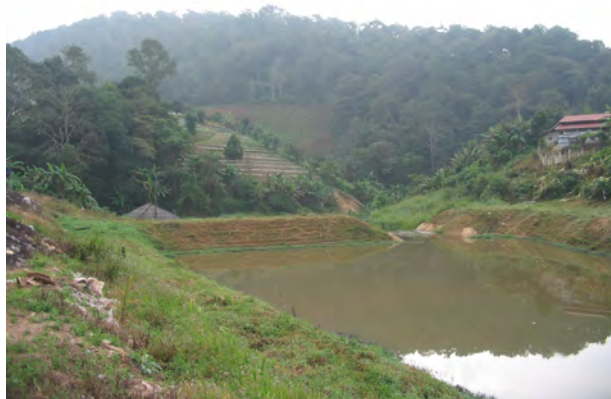
Figure1. For new sites the risk of causing environmental harm on and off the site is assessed for the proposed use.

Practice 2. For new sites, the risk of causing environmental harm on and off the site is assessed for the proposed use and a record is kept of all potential hazards identified. The risk assessment shall consider: - the prior use of the site, - potential impacts of crop production and postharvest handling on and off the site, and - potential impacts of adjacent sites on the new site.