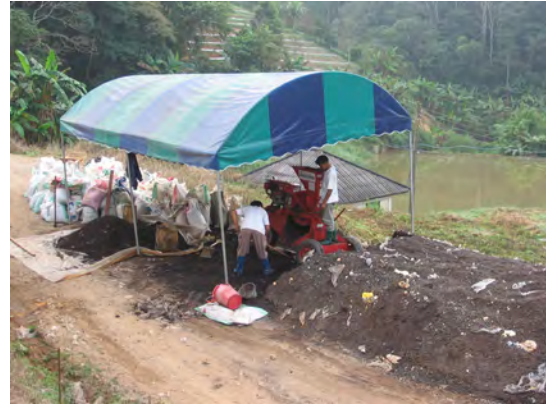
Figure 6. Storage, mixing and loading areas for fertilizers and soil additives should be positioned to minimise the risk of pollution of waterways and groundwater.

Practice 14. Equipment used to apply fertilisers and soil additives is maintained in working condition and checked for effective operation at least annually by a technically competent person.