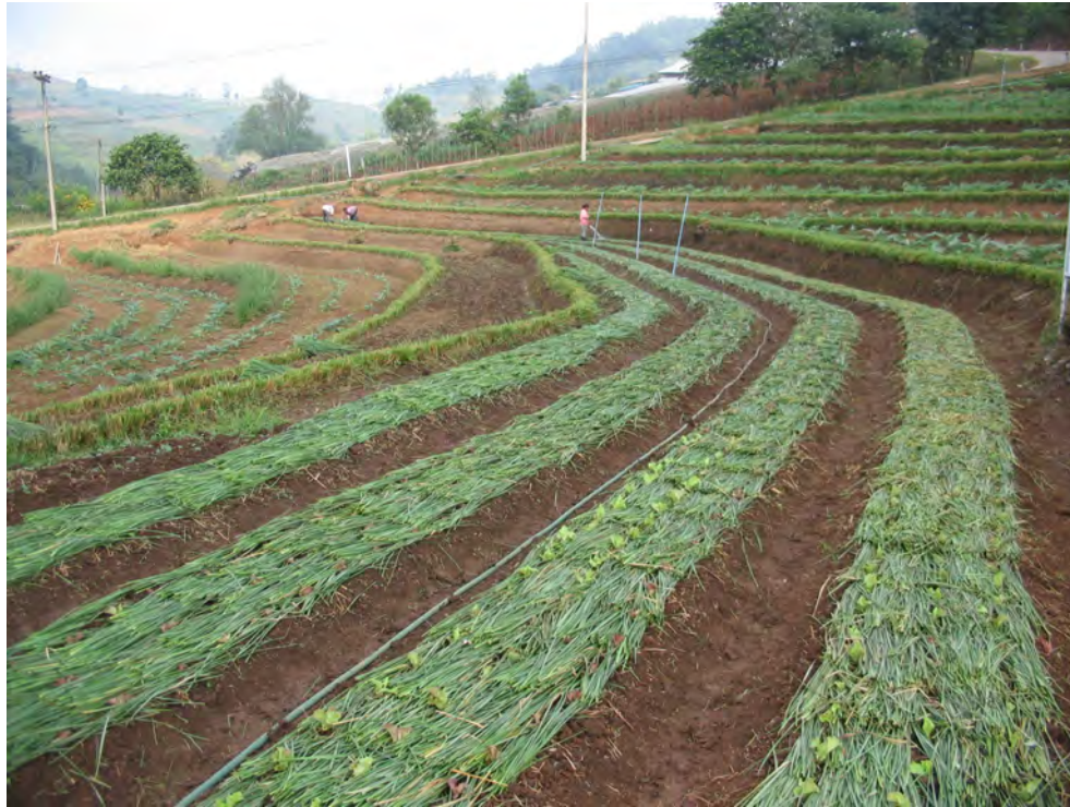
Figure3. To minimise the risk of soil erosion, use natural contour lines and organic mulches

Practice 9. Where available, soil maps are used to plan rotation and production programs.