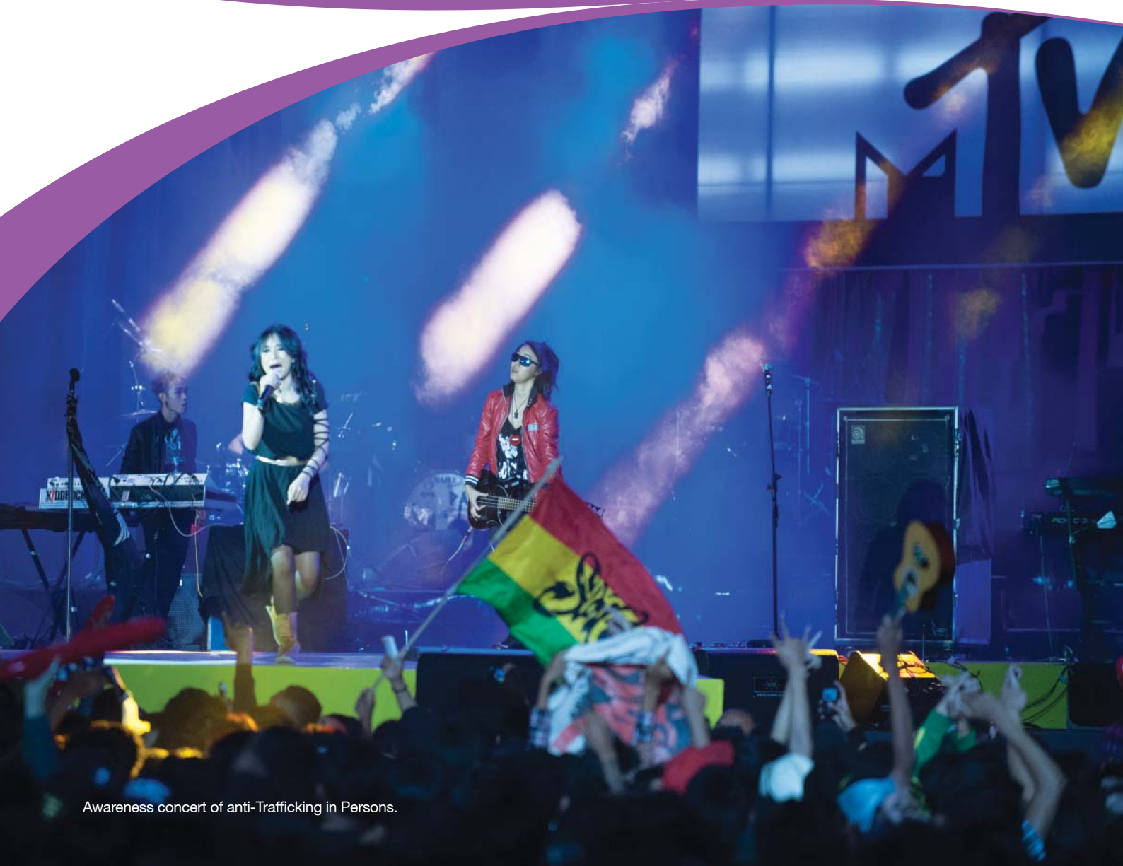
Awareness concert of anti-Trafficking in Persons.