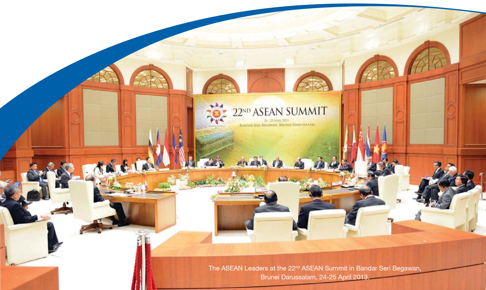
The ASEAN Leaders at the 22 nd ASEAN Summit in Bandar Seri Begawan, Brunei Darussalam, 24-25 April 2013.

To increase ASEAN awareness, the Leaders tasked the ASEAN Community Councils to place emphasis on communicating all their efforts to the relevant sectors, people and stakeholders, including through the use of various traditional, mainstream and new media platforms and mediums.■