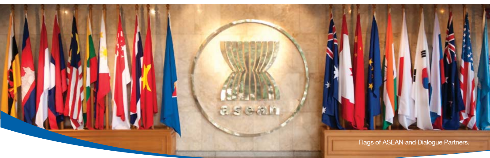
Flags of ASEAN and Dialogue Partners.