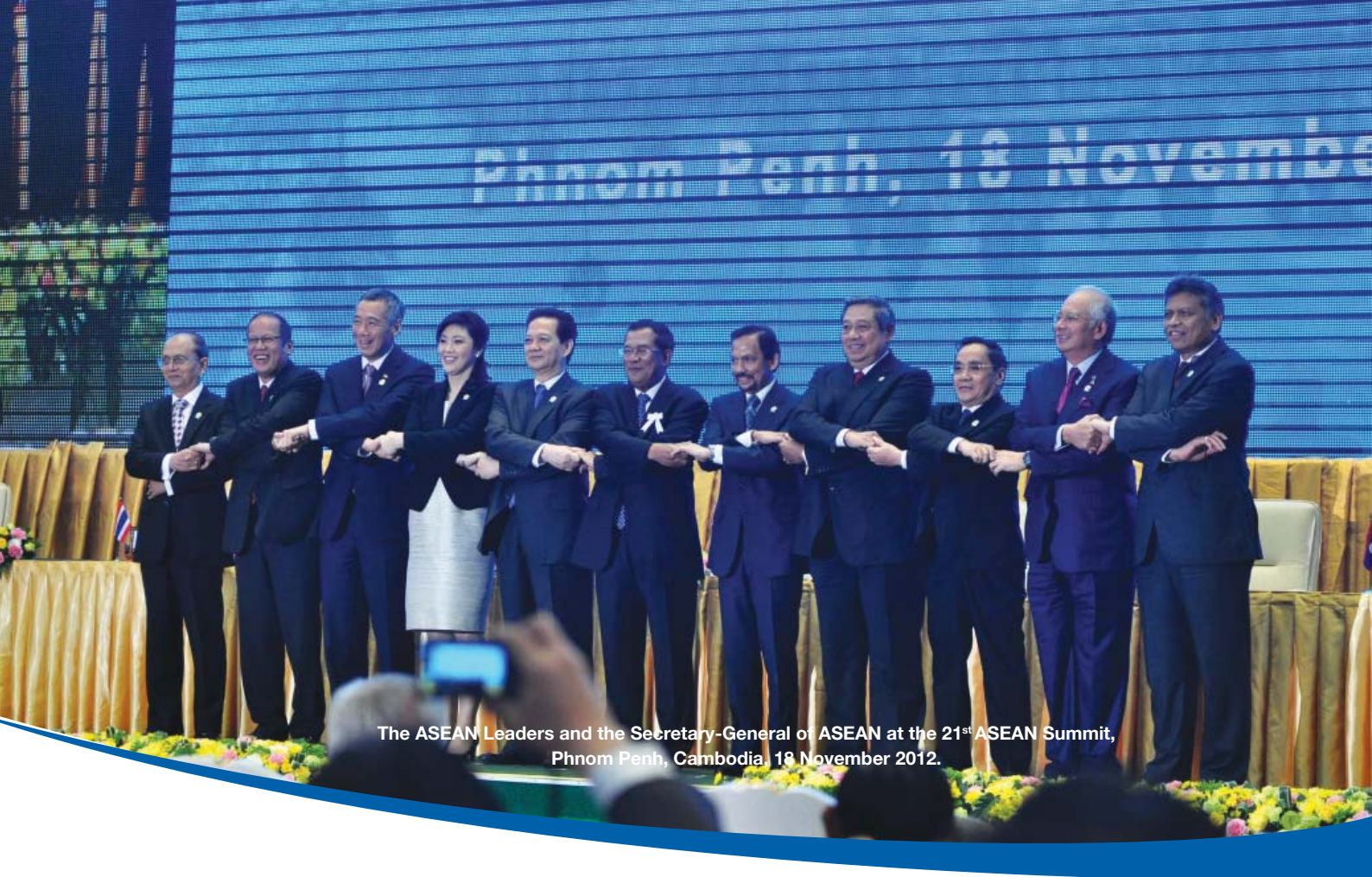
The ASEAN Leaders and the Secretary-General of ASEAN at the 21 st ASEAN Summit, Phnom Penh, Cambodia, 18 November 2012.