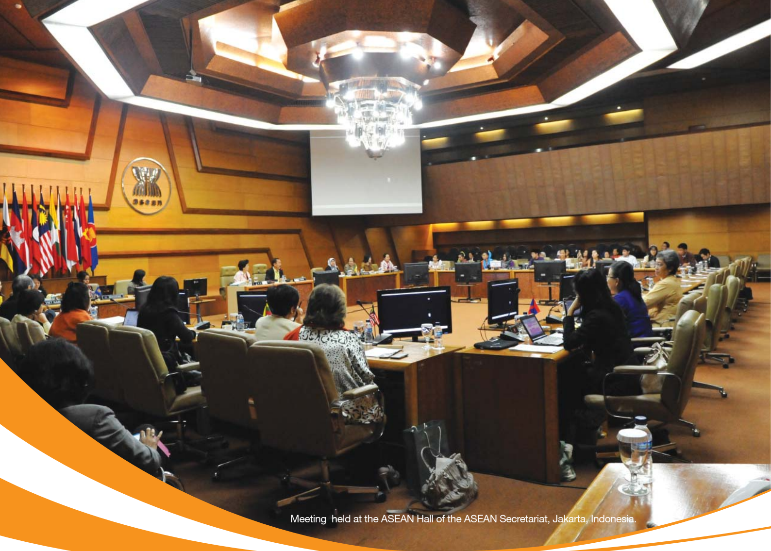
Meeting held at the ASEAN Hall of the ASEAN Secretariat, Jakarta, Indonesia.