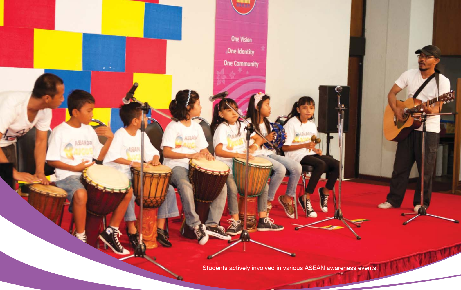
Students actively involved in various ASEAN awareness events.