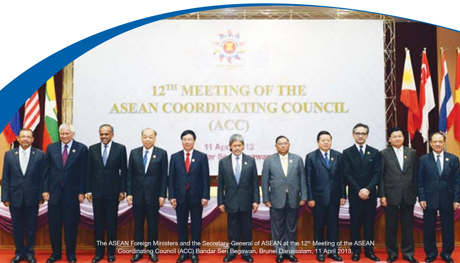
The ASEAN Foreign Ministers and the Secretary-General of ASEAN at the 12 th Meeting of the ASEAN Coordinating Council (ACC) Bandar Seri Begawan, Brunei Darussalam, 11 April 2013.

ASEAN is also making progress in the area of conflict resolution and management. The launch of the ASEAN Institute for Peace and Reconciliation (AIPR) during the 21 st ASEAN Summit is a testimony to this effort. The AIPR is the ASEAN research institution on conflict resolution and management. It will enhance peace, security and stability in the region. Work is underway to operationalise the AIPR with the Governing Council of the Institute being put together now. In an effort to provide a framework for regional cooperation to tackle the humanitarian aspects