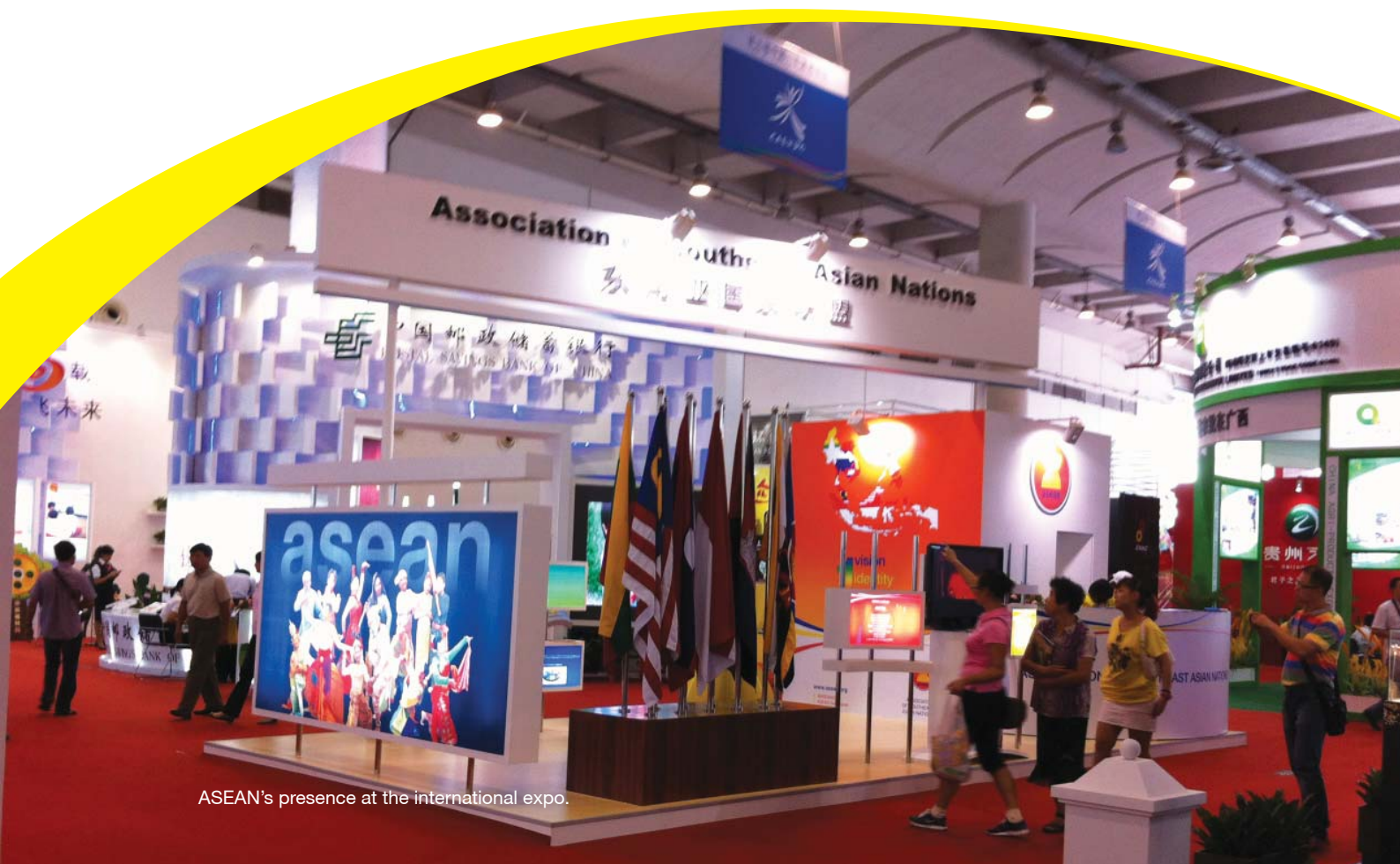
ASEAN's presence at the international expo.

Efforts to implement the ASEAN Framework for Equitable Economic Development that are intended to narrow the development gap in the region have gained momentum with new initiatives such as financial inclusion being introduced. Meanwhile, negotiations for the Regional Comprehensive Economic Partnership, which will further cement ASEAN's centrality when completed by 2015, have also started.