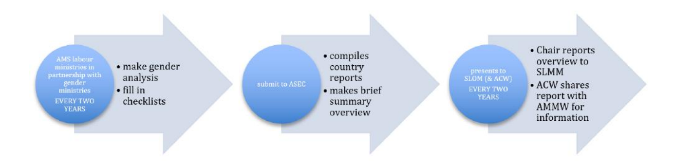
Figure 1 The process of monitoring implementation of the Guideline

[29]For further terminology see Glossary of Key Terms in Evaluation and Results Based Management, OECD, Paris: OECD, 2002 available at <a href="https://www.oecd.org/dac/evaluation">www.oecd.org/dac/evaluation</a>