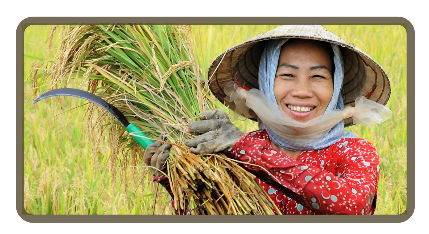
What makes this a promising practice? Action based on research not rumours. (Source: Gender equality in Recruitment and Promotion Practices in Vietnam , ILO Vietnam Country Office, Policy Brief, Ha Noi, March 2015 available at <a href="https://www.ilo.org/wcmsp5/groups/public/---asia/---ro-bangkok/---ilo-hanoi/documents/publication/wcms_349666.pdf">https://www.ilo.org/wcmsp5/groups/public/---asia/---ro-bangkok/---ilo-hanoi/documents/publication/wcms_349666.pdf</a>)