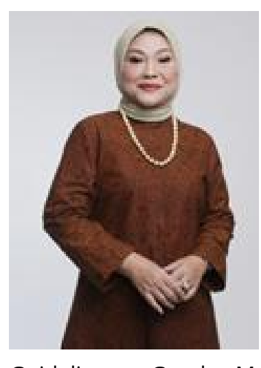
Foreword by H.E IDA FAUZIYAH

Minister of Manpower of the Republic of Indonesia, Chair of ASEAN Labour Ministers Meeting 2020-2022