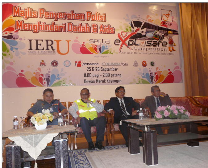
Picture 9. Example of awareness campaign in collaboration with various agencies and NGOs in conjunction with handing over of HIV/AIDS at Workplace policy