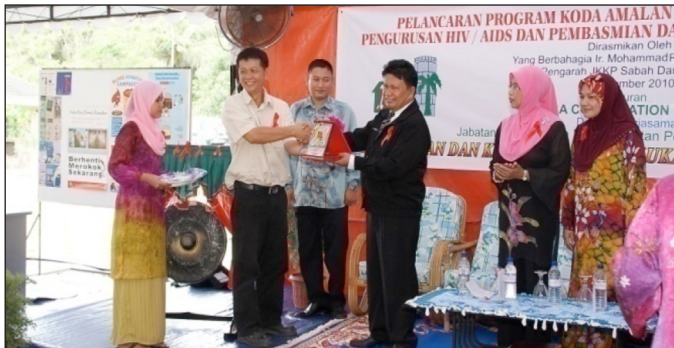
Picture 8. Example of policy handover ceremony by a small and medium enterprise company to state director of Department of Occupational Safety and Health Malaysia