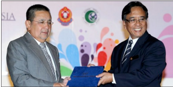
Picture 7. Example of policy handover ceremony by a multinational company to the Director General, Department of Occupational Safety and Health Malaysia