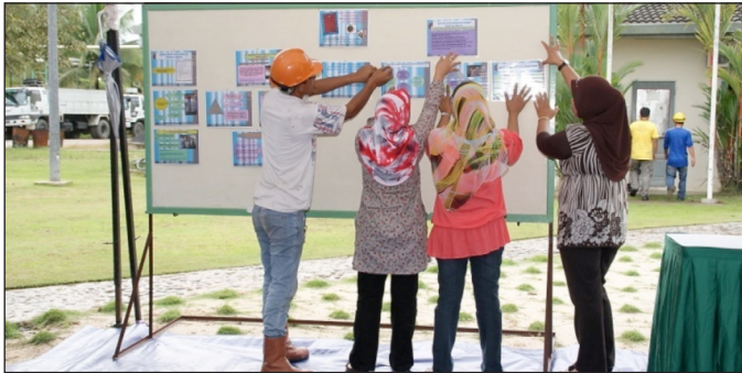
Picture 3. Preparation for awareness programmes at workplace