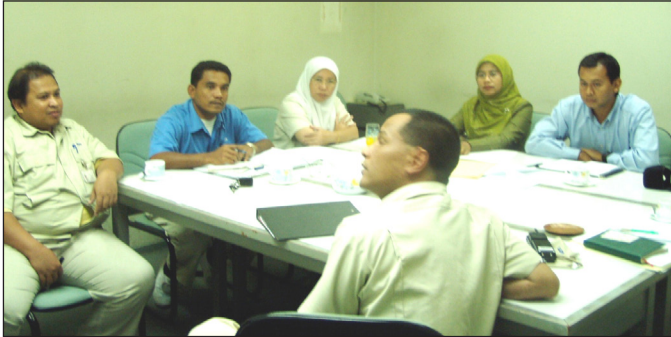
Picture 1. Continuous guidance and assistance from Department of Occupational Safety and Health throughout the process of policy making