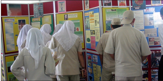
Picture 5. Employees reading on promotional materials displayed