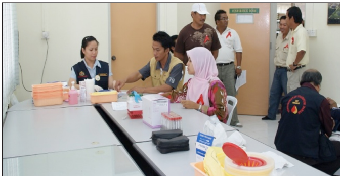
Picture 6. Voluntary and confidential blood testing programme organized as part of awareness campaign