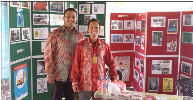
Picture 4. Promotional booth on COP of HIV/AIDS on Prevention and Management of HIV/AIDS