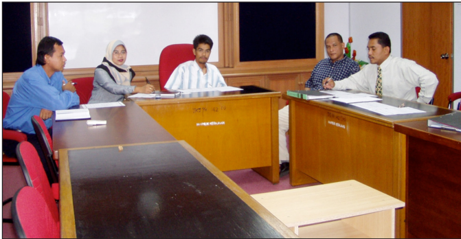
Picture 2. Discussion with the officials from Department of Occupational Safety and Health - Preliminary planning prior to the launch of the policy