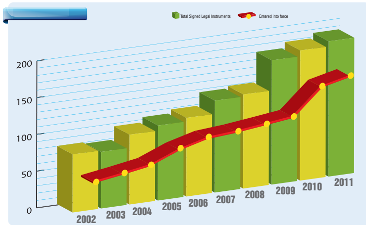
Figure 1. Number of Signed AEC Legal Instruments

The number of AEC legal instruments signed has grown considerably over time (Figure 1). Currently, there are 184 signed legal instruments under AEC, of which 137 (74.5%) have already been entered into force and the remaining are still awaiting ratification by Member States. Most of the legal instruments signed and entered into force are concentrated under Pillar 1(Single Market and Production Base). The gap between the number of signed legal instruments and those that have entered into force is expected to be reduced in the future in line with the increasing willingness and commitment of Member States to realise the ASEAN Economic Community by 2015.