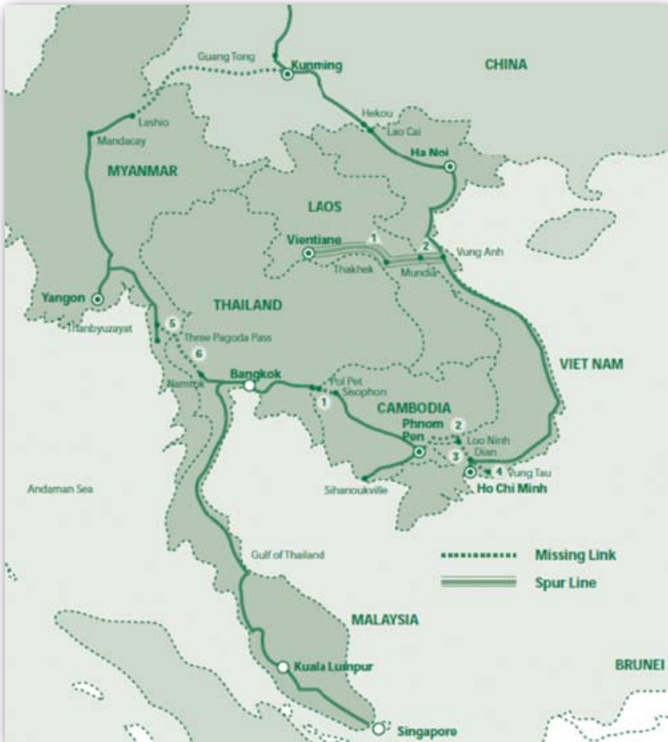
FIGURE 1. SKRL NETWORKS AND MISSING LINKS