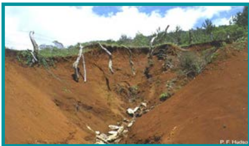
Figure 2. Highly degraded areas must be managed to minimise further degradation

Highly degraded sites must be identified and a management plan developed to minimise further degradation. For example, if a production site has severe soil erosion, planting grass on the headlands and installing cut-off drains and diversion banks will slow the water flow and divert water away from cultivated areas. Control measures should be monitored to check that further degradation is not occurring.