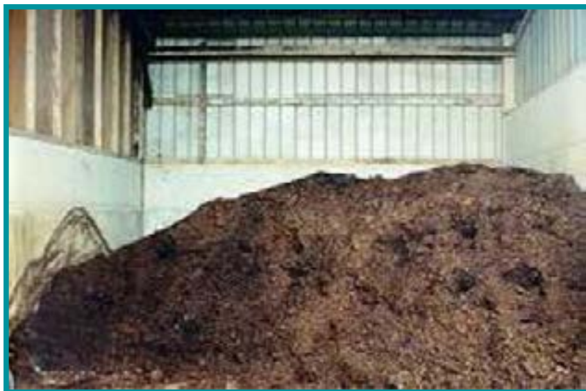
Figure 11. Offensive odours can be caused by animal manures, waste disposal sites for produce, composting sites and activities, and waste management equipment.

Another good practice is to dig the manure into the soil as quickly as possible. The best method is to incorporate it as it is put on, or to inject it. As with the storage area, natural and man-made barriers between production areas and neighbours can greatly reduce the likelihood of complaints. Apart from the visual effect, barriers can also help to filter and thin out odours.