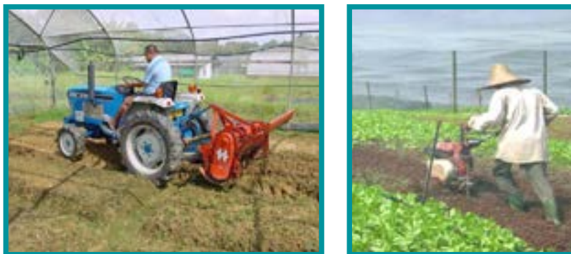
Figure 3. Good cultivation practices must be used to maintain soil structure and minimise soil erosion and compaction.

avoided. Secondary tillage operations after planting should be minimised where possible.