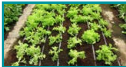
Drip or trickle irrigation