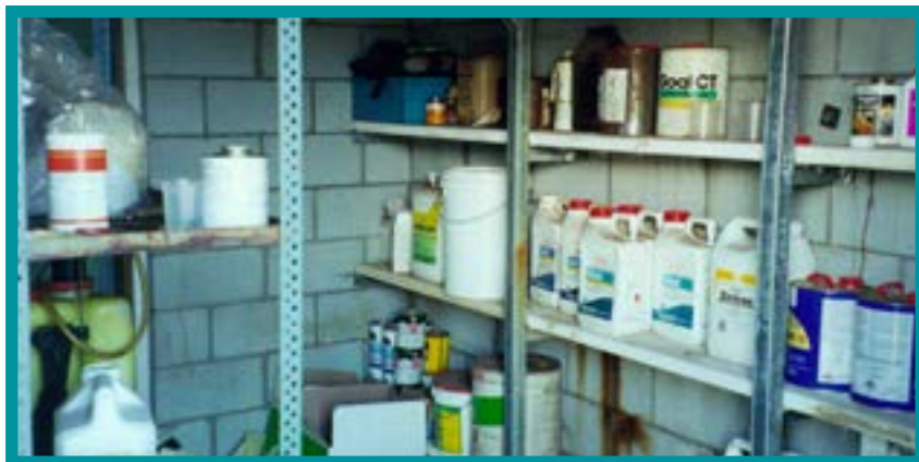
Figure 8. Chemicals must be stored in a well lit, sound and secure structure, with only authorised people allowed access.

Do not store chemicals with chlorine or fertilisers containing ammonium nitrate, potassium nitrate or sodium nitrate as spillage may cause explosions.