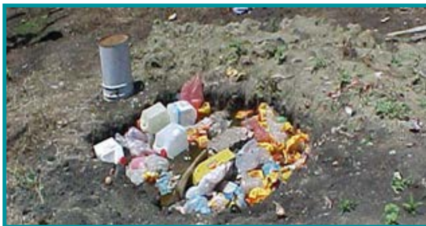
Figure 10. If disposing of waste materials on site, do not bury or dump materials close to waterways or where run-off or leaching from the materials can contaminate waterways or ground water.

Regular maintenance of vehicles and equipment ensures efficient operation and reduces energy use and costs.