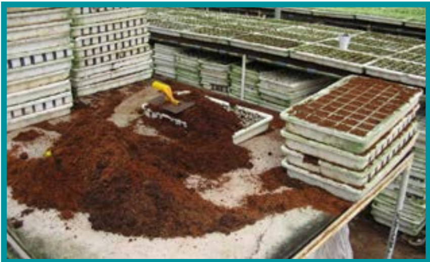
Figure 4. The use of chemical fumigants to sterilise soils and substrates is justified.

The information to record includes the fumigant name, the location where used, date of application, application rate and method, and operator name. This information can be recorded in a log book or on a record form. Examples of records for obtaining and applying chemicals are contained in Section 5. Examples of documents and records.