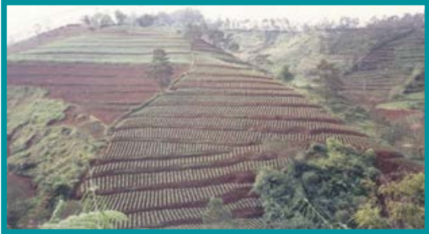
Figure 1. In some ASEAN countries there are restrictions on the altitude at which farming can be undertaken.

It is important to check for laws that may restrict farming operations at high altitude. For example, in Malaysia new farms are not permitted at altitudes above 1000 metres.