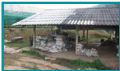
Store fertilisers in a covered area