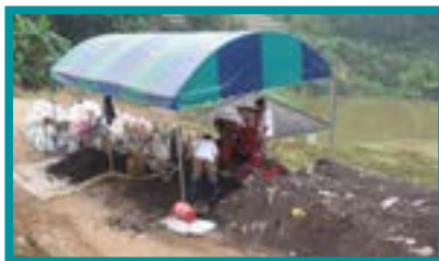
Locate compost away from waterways