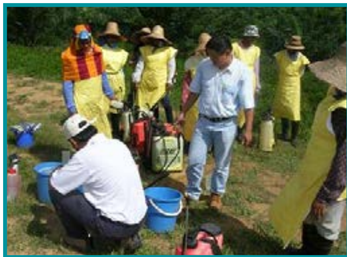
Figure 7. Employers and workers must be trained in chemical use to a level appropriate to their area of responsibility.

Evidence is required to show that people have been trained to the appropriate level. This may vary from a certificate from a formal training course to a note in a log book. The information to record is the person's name, date of training and topics covered.