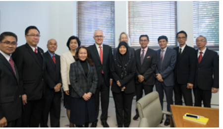
The CPR, at the invitation of the Australian Government, met with Australian Prime Minister Malcolm Turnbull MP as part of its working visit to Australia on 27 May to 3 June 2017 in preparation for the ASEAN-Australia Special Summit from 17-18 March 2018 in Sydney.

The CPR also conducts annual interfaces with delegations of the United Nations and with other ASEAN bodies, like the ASEAN Intergovernmental Commission on Human Rights (AICHR). The CPR also engages civil society to exchange views on ASEAN-related issues