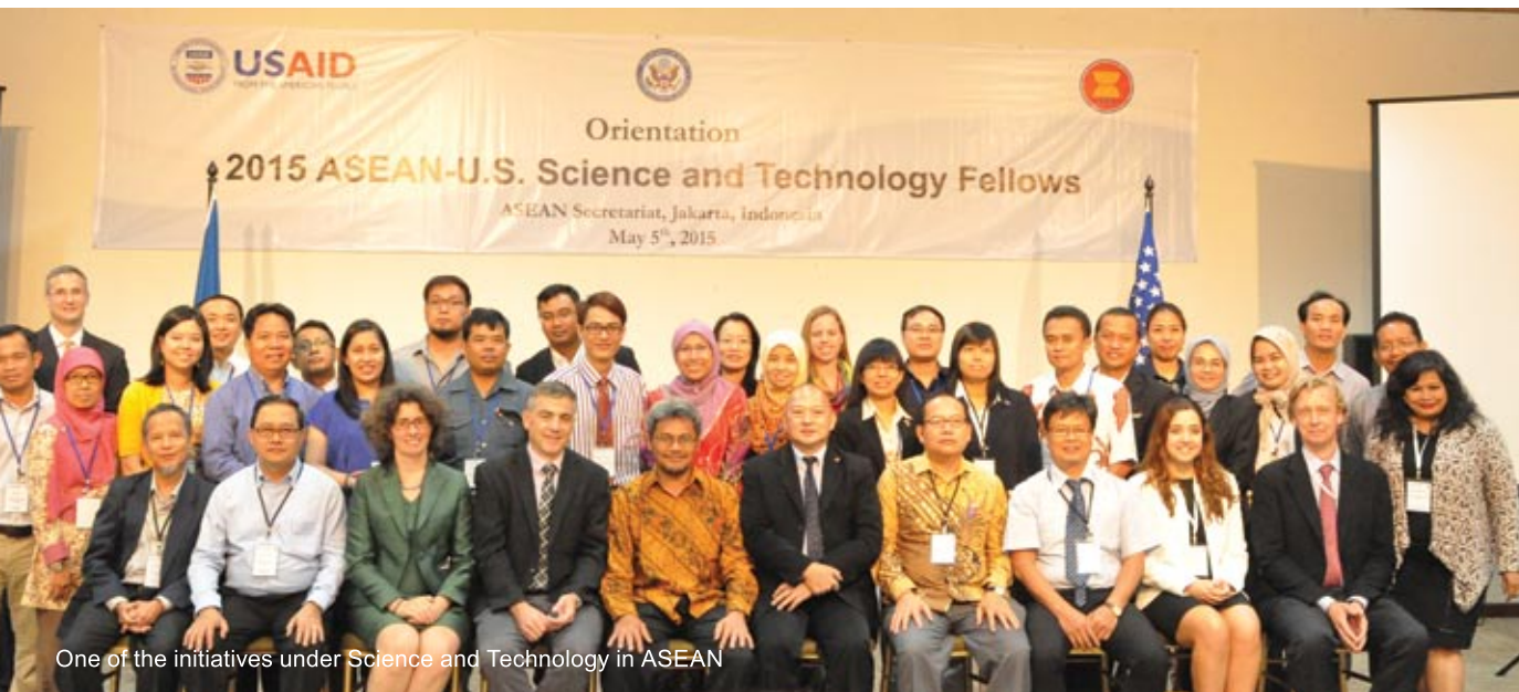
One of the initiatives under Science and Technology in ASEAN

(UL) in granting a special prize for ASEAN-US Prize for Women in Science in the field of water quality research.