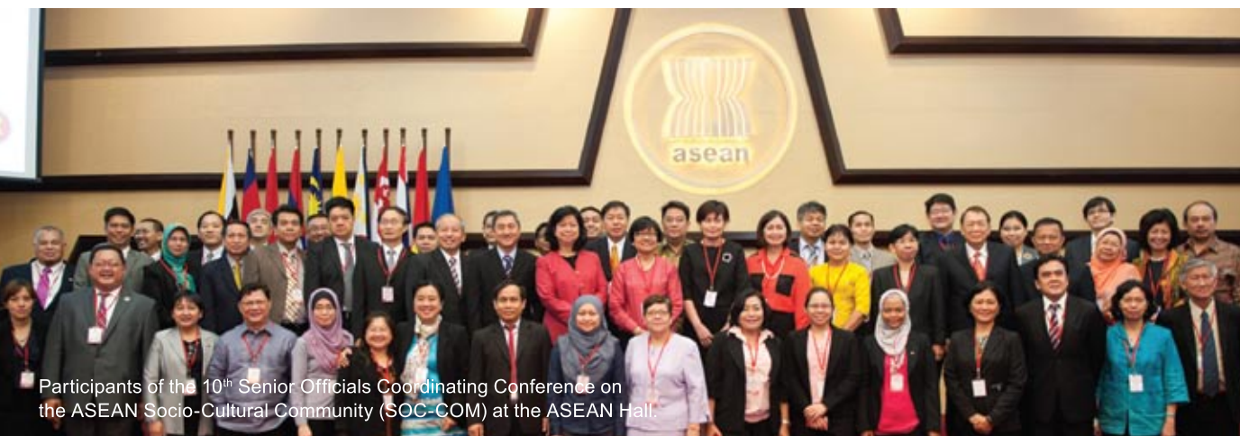
Participants of the 10 th Senior Officials Coordinating Conference on the ASEAN Socio-Cultural Community (SOC-COM) at the ASEAN Hall.

For 2014 under the Chairmanship of Myanmar, the ASCC has placed high priority on multisectoral responses to Disaster Management and Disaster