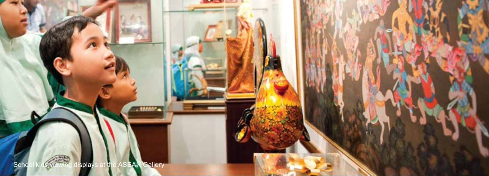
School kids viewing displays at the ASEAN Gallery