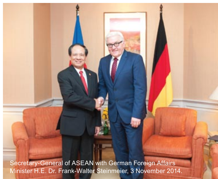
Secretary-General of ASEAN with German Foreign Affairs Minister H.E. Dr. Frank-Walter Steinmeier, 3 November 2014.