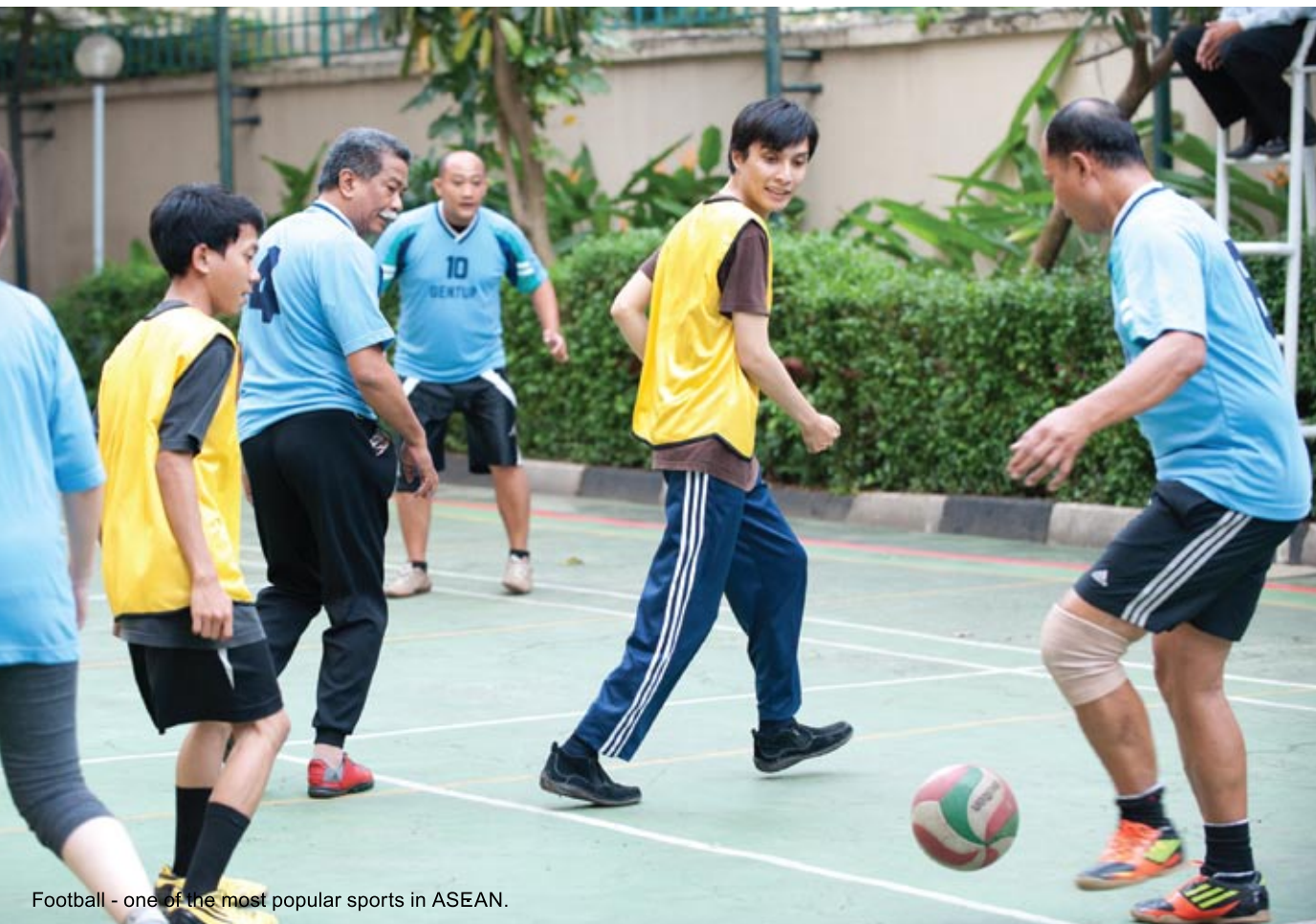
Football - one of the most popular sports in ASEAN.

was adopted in the Meeting, gives recognition to ASEAN common values and identities, wide promotion of healthy lifestyles, active networking and youth engagement programs, and sports science as a discipline dynamically growing in the years to come.