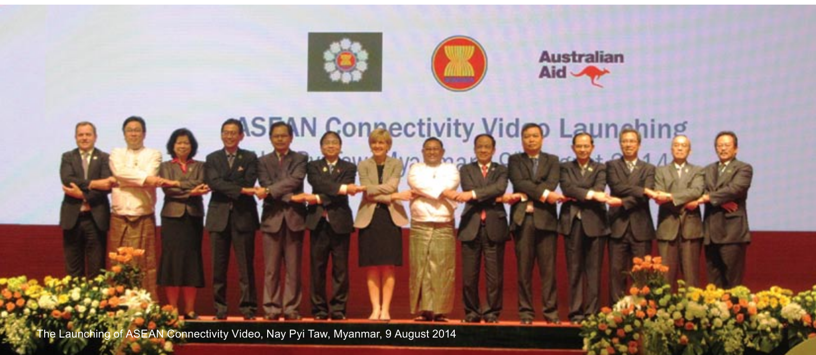
The Launching of ASEAN Connectivity Video, Nay Pyi Taw, Myanmar, 9 August 2014