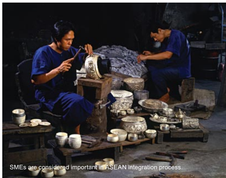
SMEs are considered important in ASEAN integration process.

submitted for endorsement by the ASEAN Economic Ministers at the 47 th AEM Meeting in August 2015.