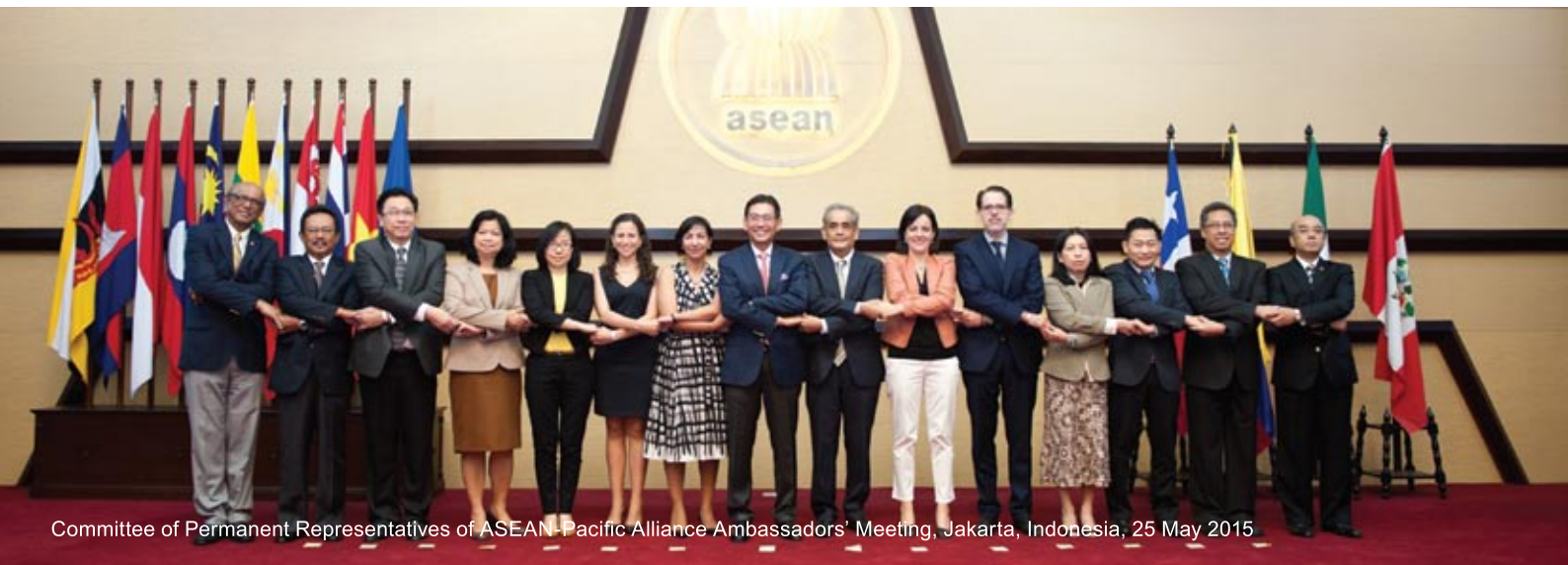
Committee of Permanent Representatives of ASEAN-Pacific Alliance Ambassadors' Meeting, Jakarta, Indonesia, 25 May 2015

The CPR continues to enhance its engagement with ASEAN Dialogue Partners and external parties to promote meaningful and substantive external relations in support of ASEAN community building. The CPR convenes regular Joint Cooperation Committee meetings with Dialogue Partners as well as informal meetings with Ambassadors to ASEAN from other external partners, including from the Pacific Alliance. This year, the CPR will complete Plans of Action for the period of 2016-2020 with Canada, India, New Zealand, Republic of Korea, the Russian Federation and the United States. The CPR conducted a stock-taking of the EAS in 2014 and has been tasked to engage with Ambassadors of the EAS Participating Countries in Jakarta to facilitate the process of strengthening and consolidation of the EAS in the evolving regional architecture.