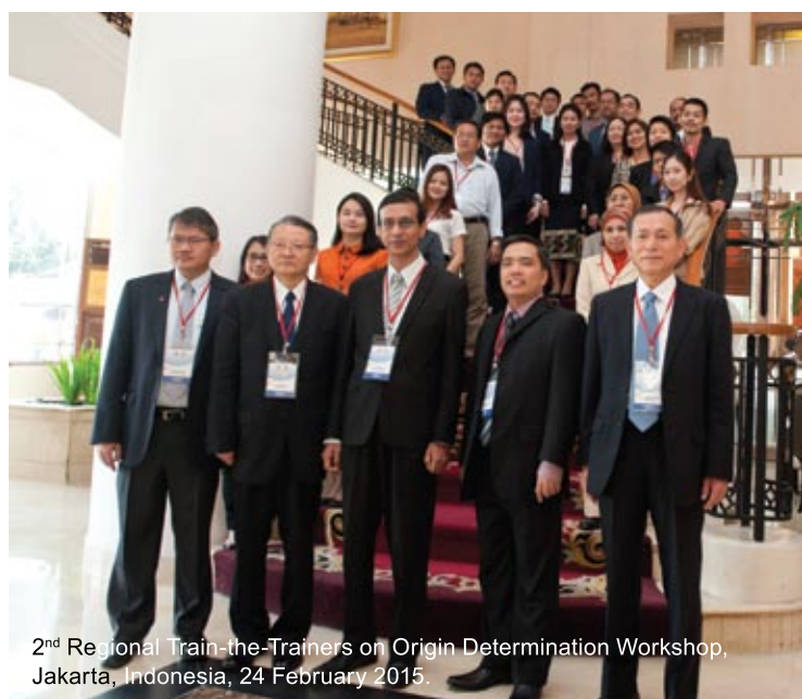
2 nd Regional Train-the-Trainers on Origin Determination Workshop, Jakarta, Indonesia, 24 February 2015.

Two Self-certification Pilot Projects are being implemented by ASEAN Member States in moving towards the realisation of the ASEAN-wide Self-certification system by 2015. Brunei Darussalam, Cambodia, Malaysia, Myanmar, Singapore and Thailand are members of the 1 st Pilot Project, while Indonesia, Lao PDR, the