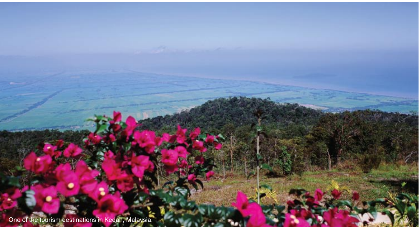
One of the tourism destinations in Kedah, Malaysia.

The ASEAN Tourism Forum (ATF) 2015 held on 22-29 January 2015 in Nay Pyi Taw, Myanmar, with the theme, “ ASEAN-Tourism Towards Peace, Prosperity and Partnership ”, was attended by 300 buyers and 905 sellers with 527 booths as well as 67 international and 57 local media.