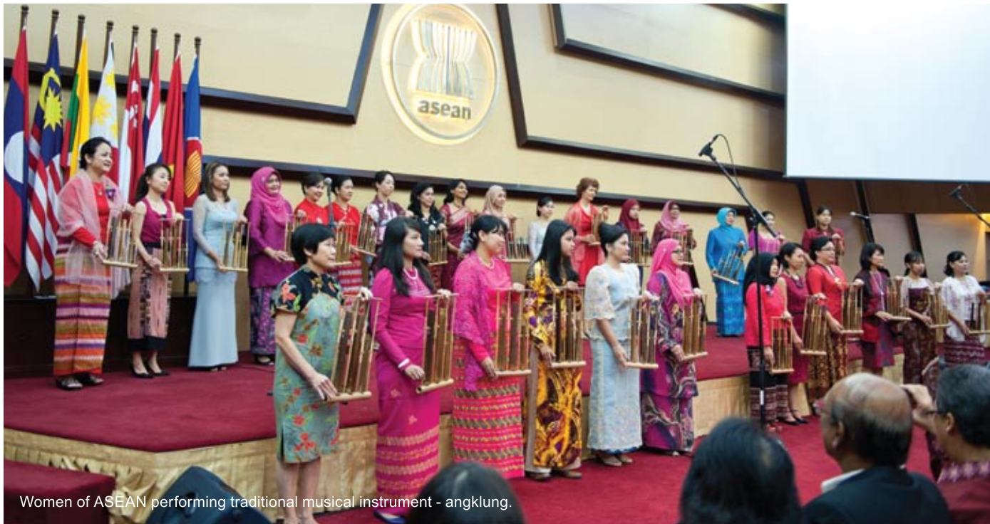
Women of ASEAN performing traditional musical instrument - angklung.

support of the International Labour Organization (ILO). The ACWC Chair also participated in several activities of AICHR in the areas of human rights, environment and climate change, rights of workers, and human rights treaty obligations last year.