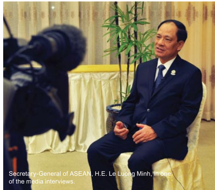
Secretary-General of ASEAN, H.E. Le Luong Minh, in one of the media interviews.

respectively. The content of the Secretariat’s social media have deliberately focused on the various dimensions of ASEAN Community.