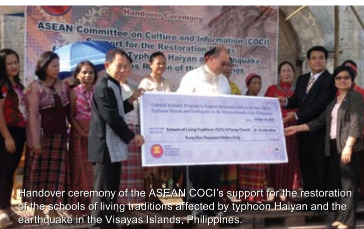
Handover ceremony of the ASEAN COCI's support for the restoration of the schools of living traditions affected by typhoon Haiyan and the earthquake in the Visayas Islands, Philippines.

The culture sector has advanced collaboration in long-running activities such as the ASEAN City of Culture and Best of ASEAN Performing Arts series which were excellent examples of promoting and inculcating appreciation for the rich cultural heritage of the ASEAN Community. A new stream of projects and activities were undertaken in 2014 and beyond, such as the ASEAN Performing Arts Festivals, ASEAN Ancient Cities Network, ASEAN Youth Heritage Leaders, and Conference on the Future of Preservation.