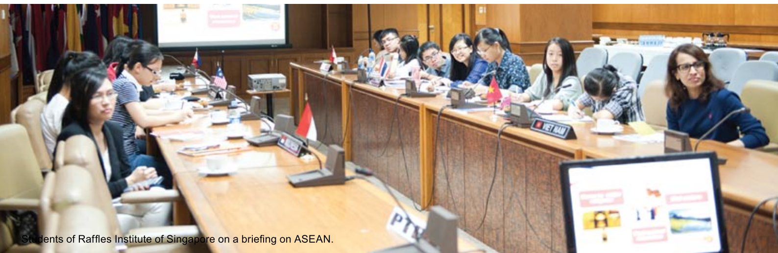
Students of Raffles Institute of Singapore on a briefing on ASEAN.