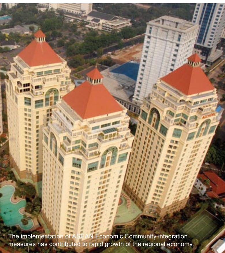
The implementation of ASEAN Economic Community integration measures has contributed to rapid growth of the regional economy.

This latest ASEAN Investment Report is entitled “ FDI Development and Regional Value Chains ”. It highlights the continuing rise of foreign direct investment (FDI) flows into ASEAN, which performed well among the developing regions. It also provides analysis on the increasing regional value chains (RVCs) in ASEAN contributed by rising FDI. RVCs in ASEAN now involve more companies, more ASEAN countries, and wider range of products and industries.