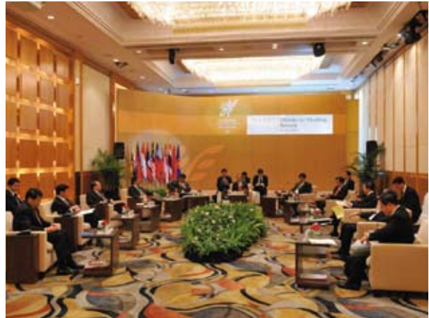
41 st AMM Retreat, 21 July 2008, Singapore

To effectively realise the APSC, the adopted APSC Blueprint is an action-oriented document with a view to achieving results and recognises the capacity and capability of ASEAN Member States to undertake the stipulated actions in the Blueprint.