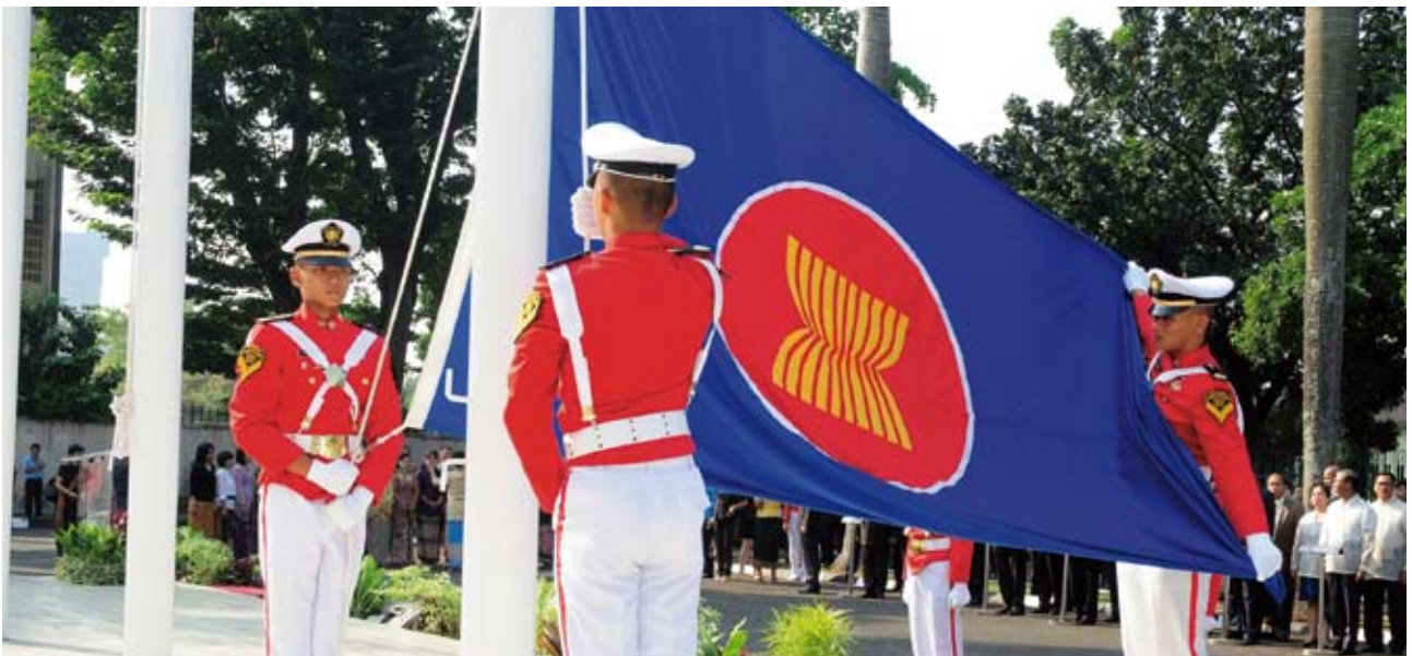
Flag Hoisting Ceremony on ASEAN Day, 8 August 2008, ASEAN Secretariat, Jakarta