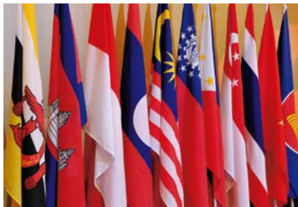
Flags of ASEAN Member States