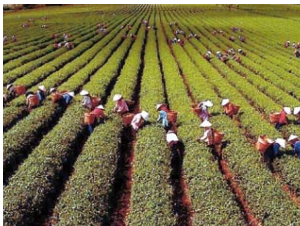
Agriculture as the main economic sector