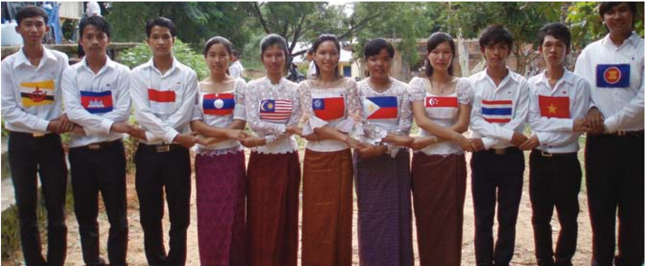
Representing the youth of ASEAN

Heads of State/Government of ASEAN– Cha-am Hua Hin Declaration on the Roadmap for the ASEAN Community 2009-2015