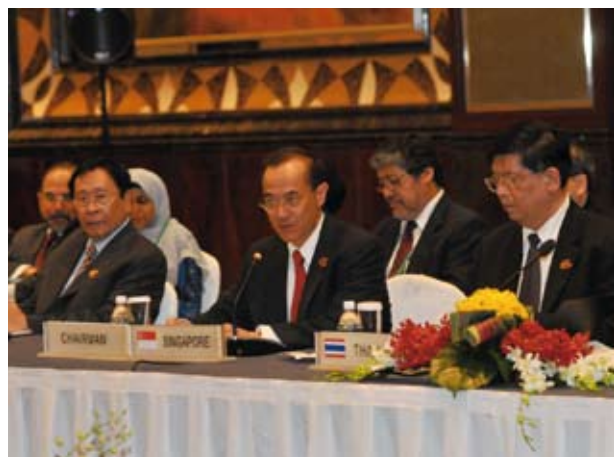
Meeting of the ASEAN Foreign Ministers with the High Level Panel on the ASEAN Human Rights Body, 21 July 2008, Singapore