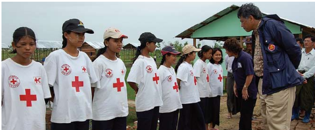
SG Surin meets participants of the ASEAN volunteers' programme in Myanmar

In early May 2008, Cyclone Nargis made landfall in Myanmar, causing extensive damage in Yangon and the Irrawady Delta, causing widespread destruction and taking nearly 140,000 lives. One year later, much has been achieved in responding to this disaster and much of this can be attributed to the work of the Yangon-based Tripartite Core Group (TCG) consisting of ASEAN, the Government of Myanmar and the United Nations.