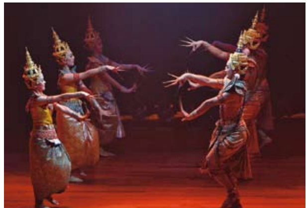
Cultural night - Commemorating 20 years of ASEAN-ROK relations