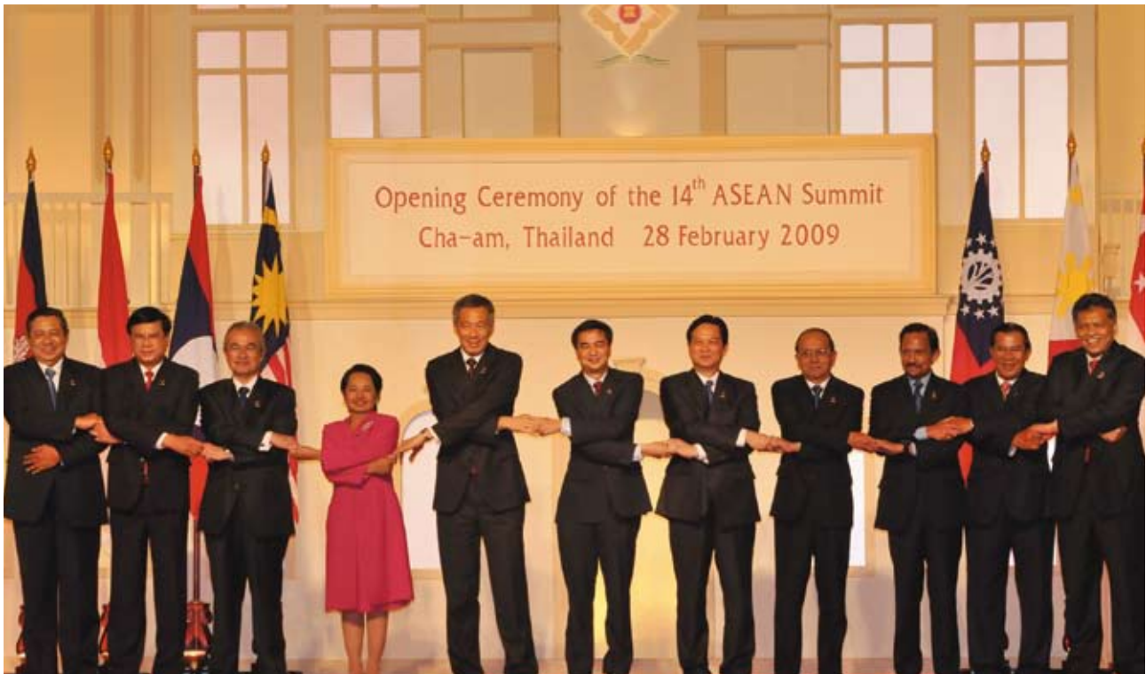
The 14 th ASEAN Summit, Thailand

The Heads of State/Government of the ASEAN Member States gathered in Cha-am/Hua Hin, Thailand, for the 14 th ASEAN Summit on 28 February and 1 March 2009, under the theme “ ASEAN Charter for ASEAN Peoples ”.