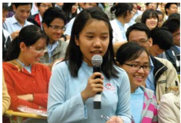
Raising an ASEAN awareness among high school students

sharing community is challenging, but ASEAN remains strongly determined and committed towards the well-being of its people, especially the vulnerable groups.