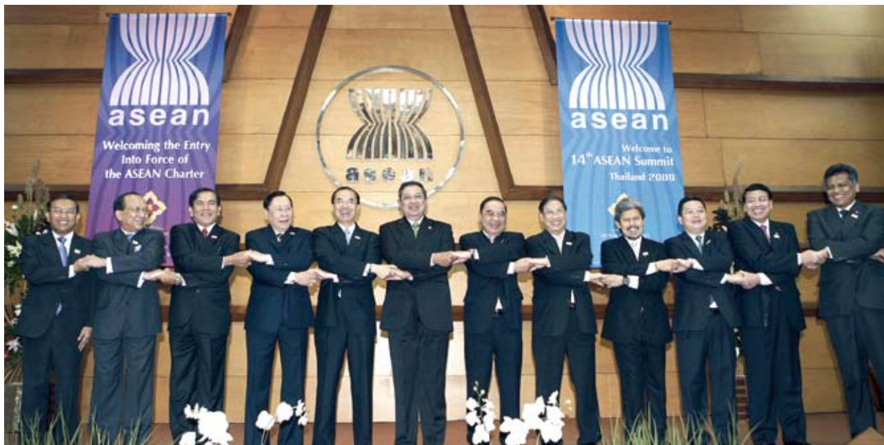
Indonesian President H.E. Dr. Susilo Bambang Yudhoyono and ASEAN FMs celebrating the entry into force of the ASEAN Charter

The ASEAN Charter has been fully ratified in all the ten ASEAN Member States. ASEAN Charter has become a legally binding agreement among the ten ASEAN Member States and will also be registered with the Secretariat of the United Nations, pursuant to Article 102, Paragraph 1 of the Charter of the United Nations.