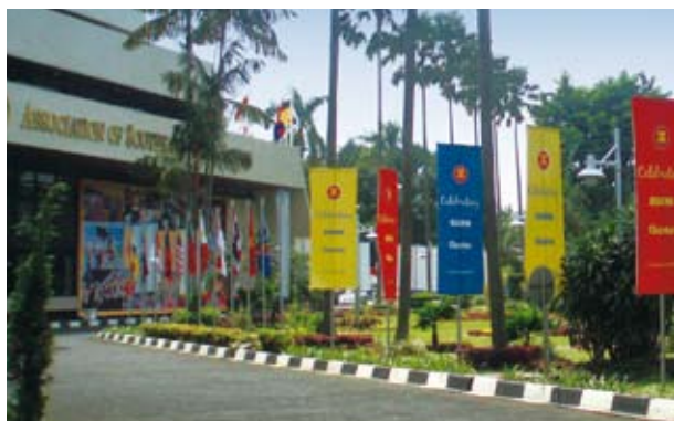
ASEAN Secretariat welcomes the entry into force of the ASEAN Charter

In his remarks, H.E. Dr. Surin Pitsuwan, the Secretary-General of ASEAN, pledged to protect and uphold the ASEAN Charter in letter and in spirit for the benefits of all the peoples of ASEAN.