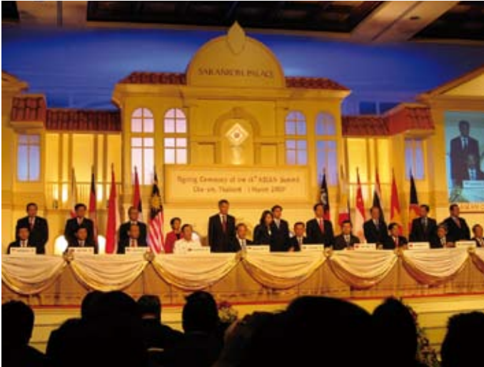
Signing ceremony of the 14 th ASEAN Summit, Thailand

“The ASEAN Political-Security Community Blueprint, the ASEAN Economic Community Blueprint, the ASEAN Socio-Cultural Community Blueprint and the IAI Work Plan 2 (2009-2015) shall constitute the Roadmap for an ASEAN Community (2009-2015).”