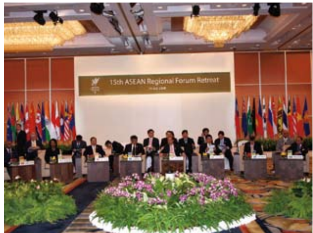
15 th ARF Retreat, 24 July 2008, Singapore