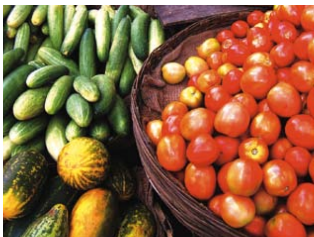
Healthy food for healthy people