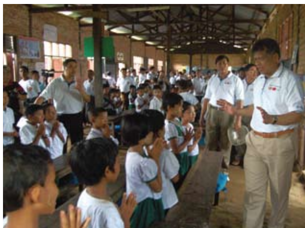
Members of the TCG meet the young victims of Cyclone Nargis

The TCG also launched the Post-Nargis Recovery and Preparedness Plan or PONREPP in early February 2009 to restore productive, healthy and protected lives of the survivors of Cyclone Nargis. The PONREPP essentially provides a framework for the recovery of the Delta over the next three years (2009-2011), focusing on eight (8) key sectors, including nutrition, health, livelihoods, disaster risk reduction and water, sanitation and hygiene. The PONREPP estimates that US$691 million will be required to recover and build back better the lives and assets of the affected people.