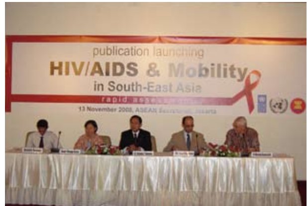
Information dissemination on HIV/AIDS

Going forward, the ASCC will continue to intensify cross-sectoral coordination and cooperation and strengthen partnership with civil society, academia and private sector. Building a caring and