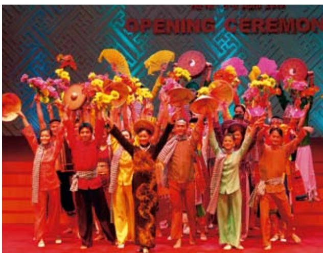
Opening Ceremony of the 16 th ASEAN Summit

The Leaders also agreed to the swap between Indonesia and Brunei Darussalam in chairing ASEAN in 2011, and welcomed Indonesia as the ASEAN Chair in 2011. Brunei Darussalam will chair ASEAN in 2013, with Cambodia as the ASEAN Chair in 2012. Indonesia requested to chair ASEAN in 2011, instead of waiting until its turn in 2013, because in 2013 Indonesia will chair APEC and may also host the G-20 Summit. This special arrangement, however, shall not create any precedent in deviating from the alphabetical rotation of the ASEAN Chairmanship, as prescribed in Article 31 of the ASEAN Charter.