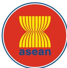
Table Flag : 10 cm x 15 cm Room Flag : 100 cm x 150 cm Car Flag : 10 cm x 30 cm Field Flag : 200 cm x 300 cm

The ASEAN emblem represents a stable, peaceful, united and dynamic ASEAN. The colours of the emblem – blue, red, white and yellow – represent the main colours of the crests of all the ASEAN Member States.