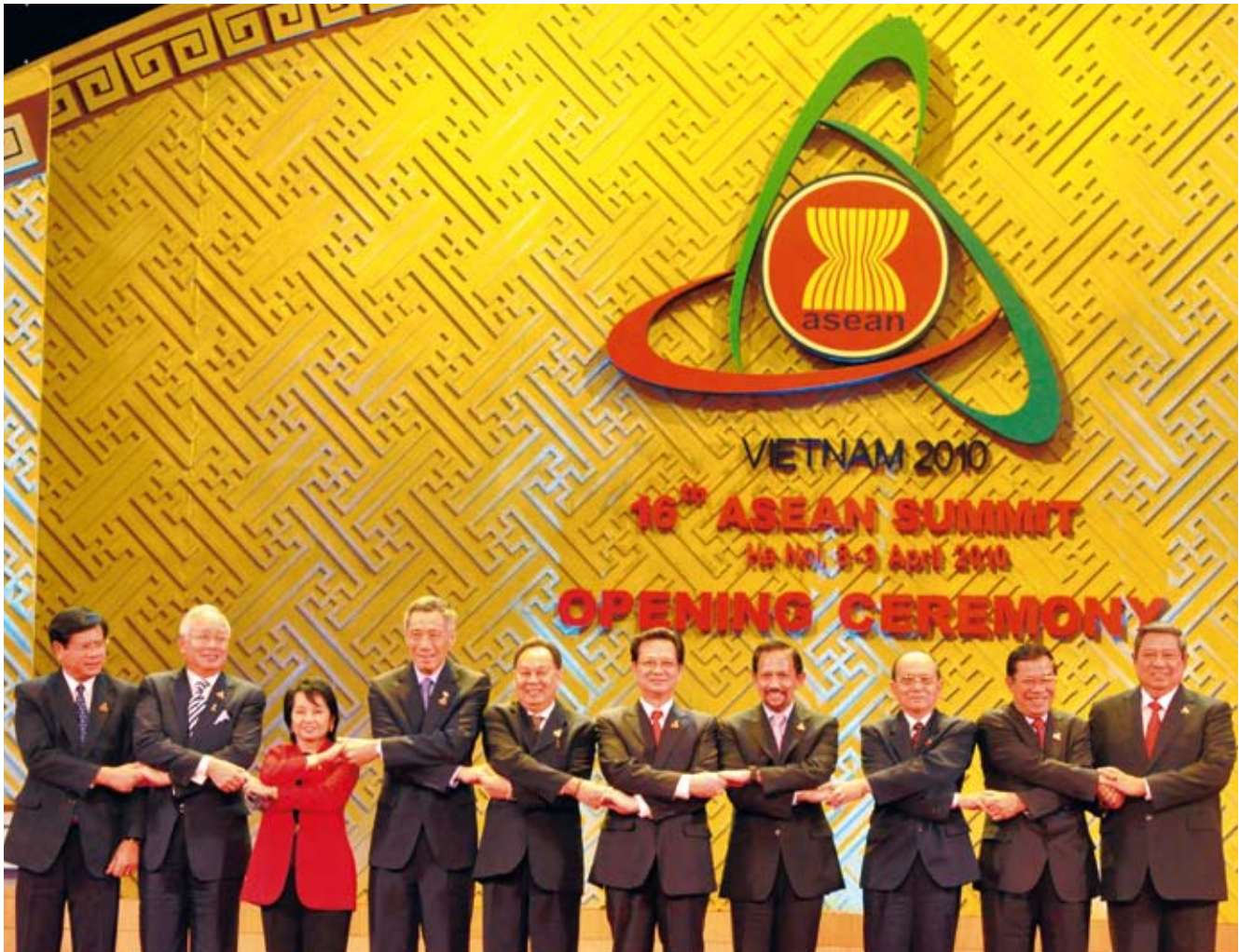
ASEAN Leaders at the Opening Ceremony of the 16 th ASEAN Summit, Ha Noi, 8 April 2010

The Leaders agreed that ASEAN would act swiftly at the national, regional and global levels to achieve sustained economic recovery and development for ASEAN