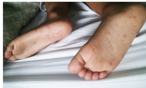
Hand, Foot and Mouth Disease.

The experts presented their experiences in surveillance, clinical management and laboratory practice in the meeting to illustrate the HFMD situation in the region. Sessions on HFMD/severe enteroviral infection laboratory surveillance system development in Thailand and an update on Inviragen's Enterovirus (EV) 71 vaccine in development were also presented in the meeting.