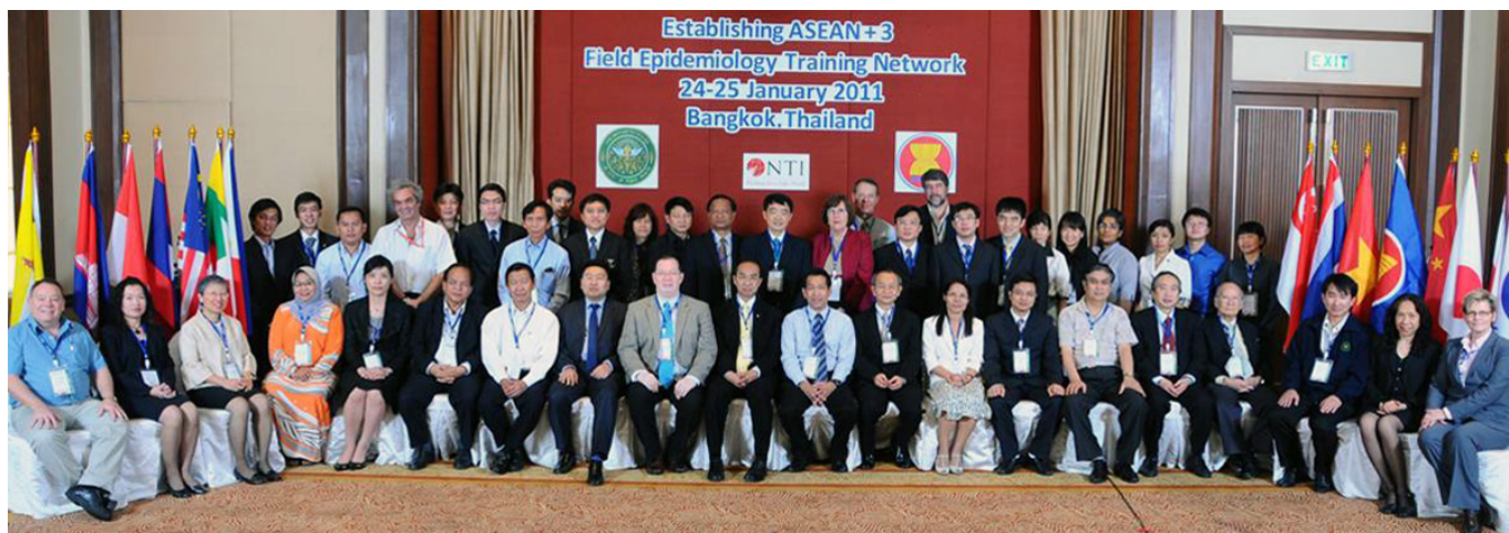
Establishing ASEAN + 3 FETN Conference in Bangkok, Thailand on 24-25 January 2011. It is composed of field epidemiology training program directors and authorities from ASEAN Member Countries and the Plus Three Countries, namely: Brunei Darussalam, Cambodia, China, Indonesia, Japan, Lao PDR, Malaysia, Myanmar, Republic of Korea, Singapore, Thailand, Philippines and Vietnam.